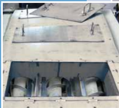
KM-4 patent pending preheater unit

The KM-4 will operate continuously under most extremes of outdoor conditions, whether in a dry desert or Northern sub-zero climates. And, although the equipment is designed for the rigors of continuous 24/7 operations, it's equally adept at 8- to 12-hour shifts.